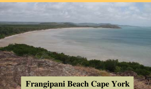
Frangipani Beach Cape York

“NO OTHER TOUR COMPANY OFFERS YOU THIS MUCH OF CAPE YORK FOR THE PRICE”