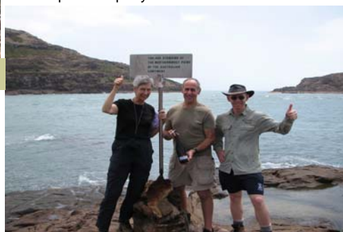
Cape York conquered at last !

That night there were a few relaxing drinks all round, once we were all reunited again at our destination. Dinner was a hearty meal overlooking the beach. Repairs were finalized by 0900 next morning so we were soon underway on the last part of our journey on the mainland of