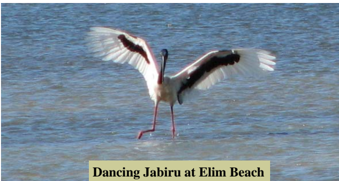
Dancing Jabiru at Elim Beach

This is the true 4WD adventure of a Cape York trip as we crossed several creeks & rivers on our way north. It was interesting trying to spot the last remaining telegraph poles along the OTT. We also had to assist a couple of other vehicles across Cockatoo Creek, with my guests walking the crossing