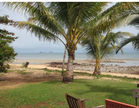
Relaxing at Loyalty Beach

Another feature on the island is the Gab Titui Cultural Centre, which has captured the soul & spirit of the 20 communities of Torres Strait. It has several unique displays explaining the history & culture of the Torres Strait Islanders. This includes an artifacts gallery, workshop areas for local artists & a meeting venue for local educational groups & community events.