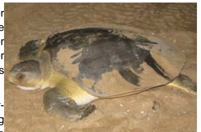
Flatback Turtle Flinders Beach

The next part of our journey saw us travel back east on to the Telegraph Road & head for the Wenlock River. Here we camped again in comfortable tent accommodation at Moreton Telegraph Station. We enjoyed a relaxing walk along the river bank before a bush style roast dinner. This rounded off another interesting day. The next morning we set off for Bramwell Junction where the road forks & our journey took us along the Old Telegraph Track.