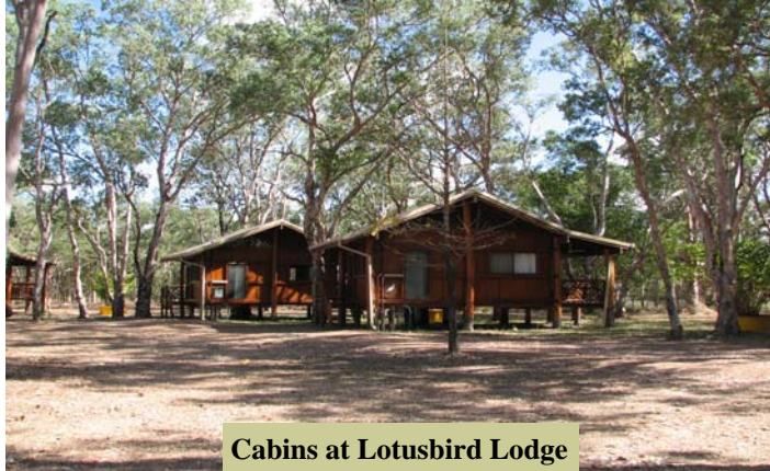
Cabins at Lotusbird Lodge