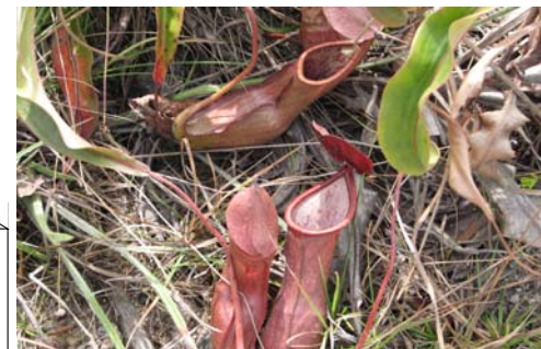
Fly-eating Pitcher Plant

Australia, the conquest of the Cape. After the walk to the very tip, one of the guests produced a bottle of champagne & we all toasted our success in making it to the top. Of course the customary photos followed & we all took in the spectacular views across to the islands of Torres Strait. It was named after the Spanish explorer who sailed through here in 1606.