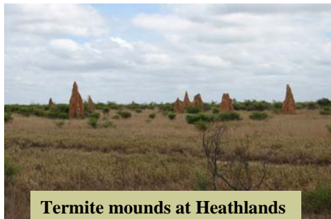
Termite mounds at Heathlands

I had also arranged a tour of the World War II museum on Horn Island for my guests. This tour is called “In Their Steps”. It is an historic display of the valuable contribution that Horn Island & its population made during the Japanese assault of the north during the Second World War.