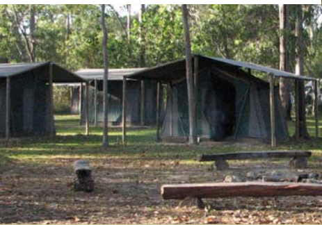
Campsite at Moreton Telegraph Station

Beach Campground by another tour operator, so it turned out to be a minor delay.